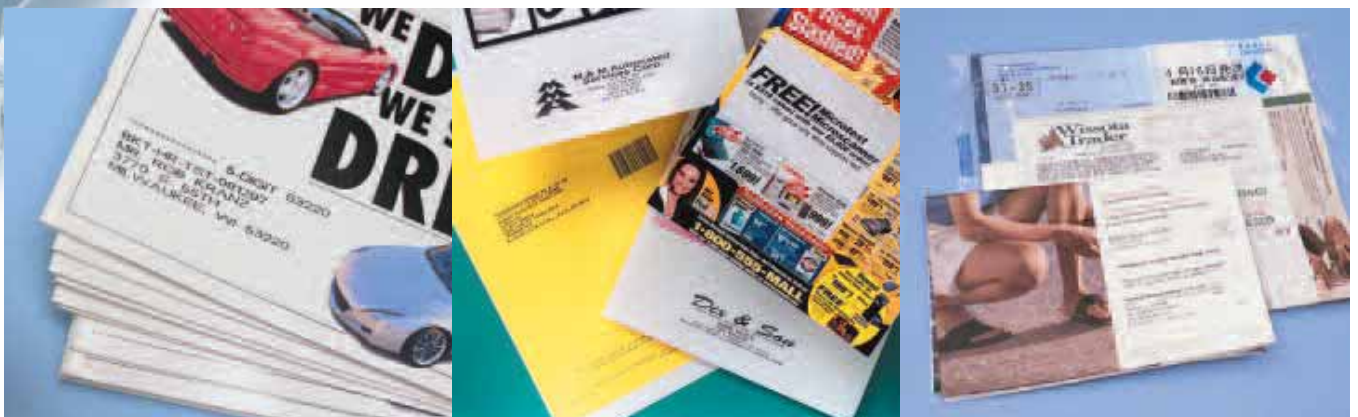
Direct, high resolution addressing reflects last minute changes to the database.