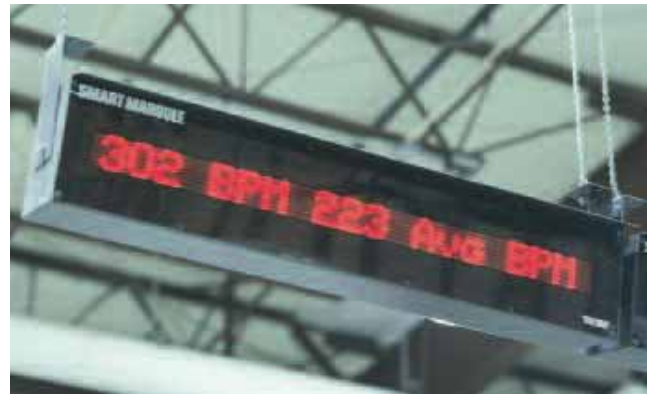
Strategic data is displayed while production statistics are compiled.